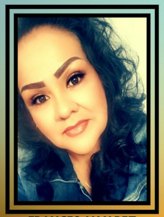
PREVENTION AND EDUCATION SPECIALIST

What has been your favorite project at Tucson Indian Center?